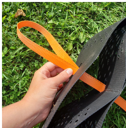
STEP #2 Grasp the tendon about 10 inches from the panel and make a loop at the tendon slot.