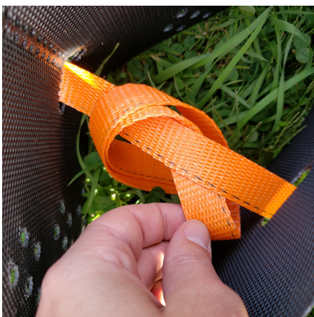
STEP #4 Cross loop under tendon.