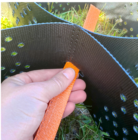
STEP # 1 Pull the tendon through the tendon slot and completely through the panel.

Geocell ground grids can easily be attached to a slope or incline with the use of a tendon fed through the slot in each cell wall.