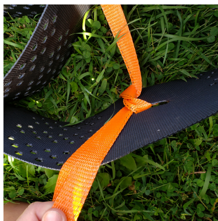
STEP #5 Feed tendon through loop, and pull until tight.