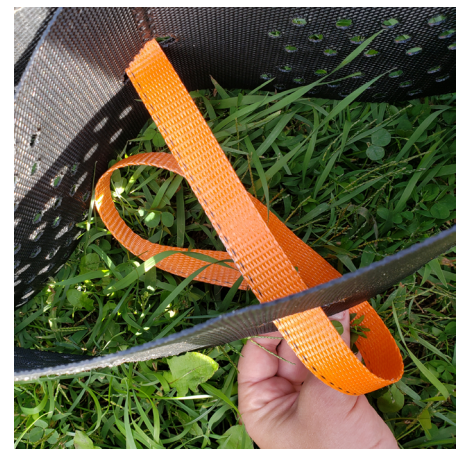
STEP #3 Feed the loop back under the cell edge of the Geocell.